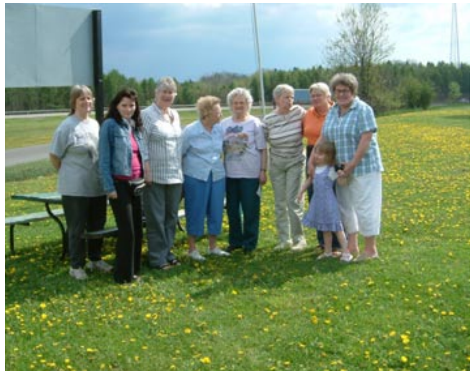
The welcome committee in Kylertown, PA