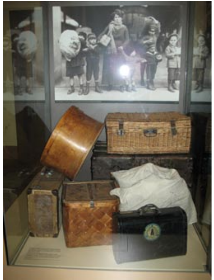
Some trunks and chests at the exhibition. Note that the sticker on the closest luggage is from Svenska Amerika Linien - Swedish American Line.