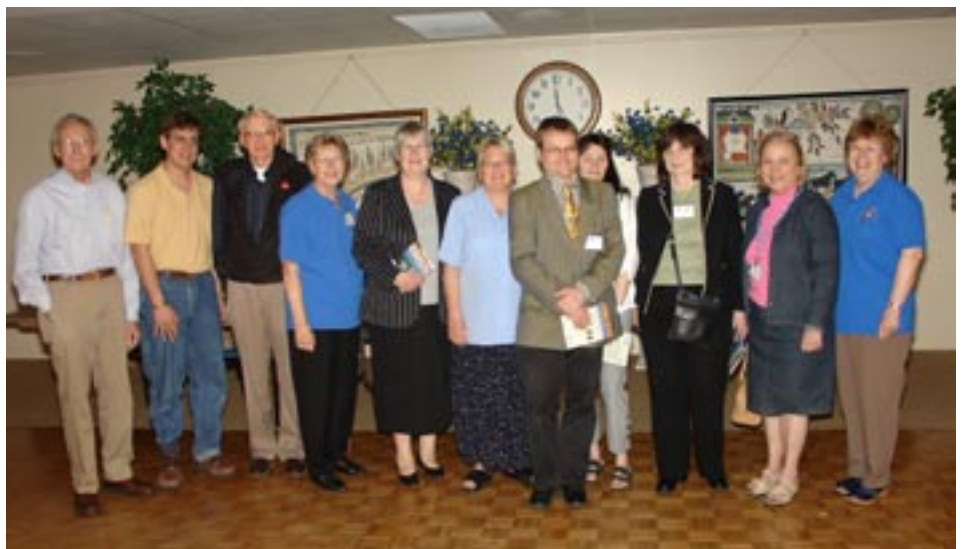
The local organizing committee of Swedish Genealogical Society of Minnesota and the SwedGen Road Tour group at the end of a long day in Minneapolis