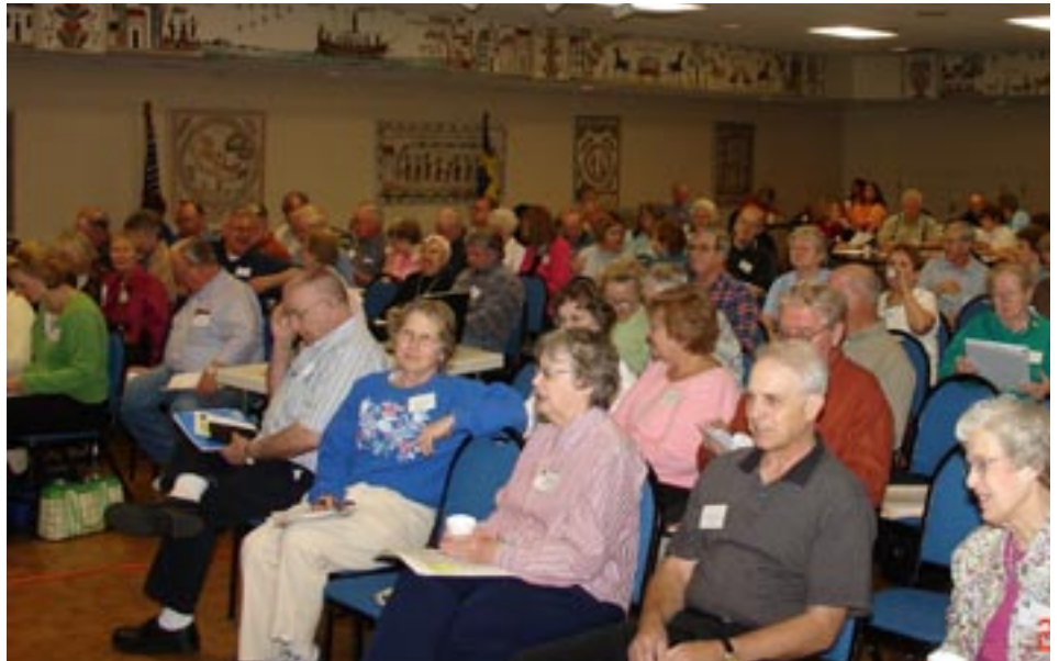
Before starting the presentations at the American Swedish Institute in Minneapolis.