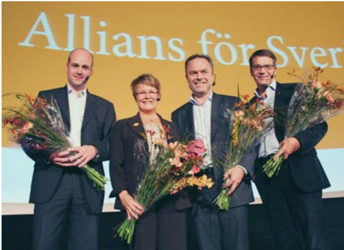
The Alliance, from left: Fredrik Reinfeldt, Maud Olofsson, Jan Björklund and Göran Hägglund.