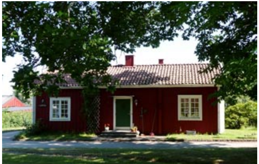
Single workers house at Lessebo bruk, Lessebo parish, Kronobergs län

The works owner typically had a manor house near the ironworks, and young daughters of the iron-workers often spent a year or two working there as