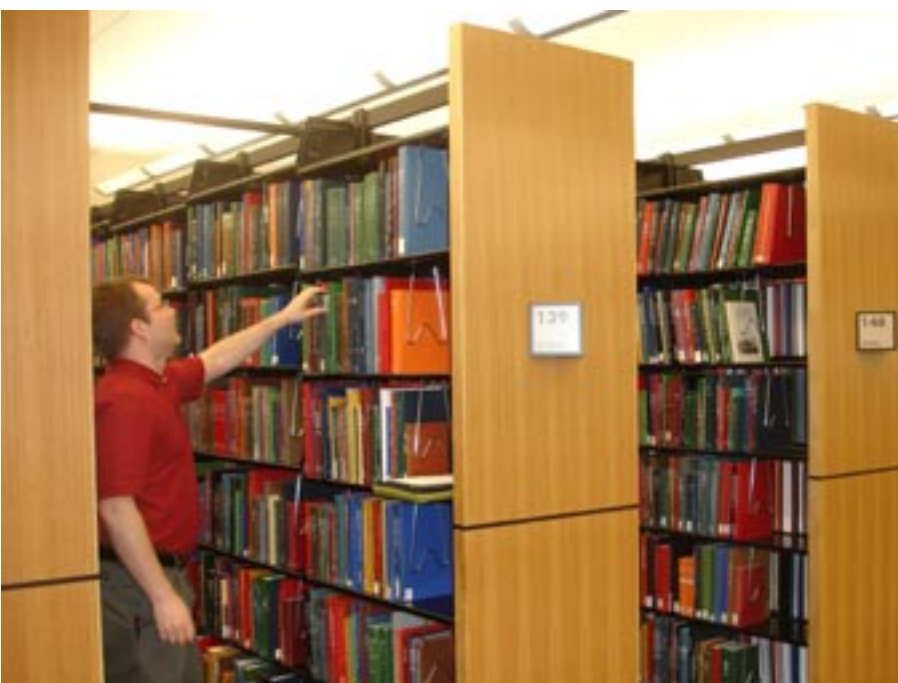
Top: One of the halls with computers for online research and beside the computers research tables and lots of bookshelves. Below: Olof Cronberg is trying to find books with Swedish relatives.