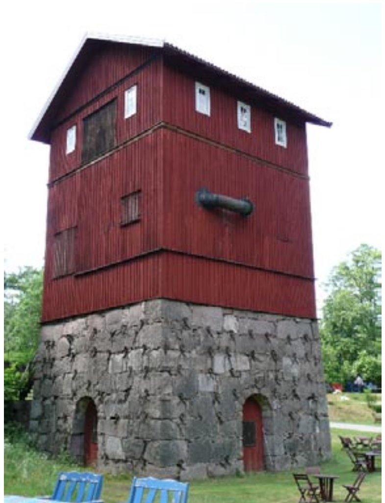
The masugn in Åryd, Hemmesjö parish, Kronobergs län, just outside of Växjö.

Unregulated bergsmän-made pig iron and bar iron was of inconsistent quality, however. The Crown decided in the late 16th century/early 17th century to make better use of Sweden's iron resources by investing capital in the system and by better controlling iron production. It was thought that having more oversight of especially bar iron production, would increase the quality level the most.