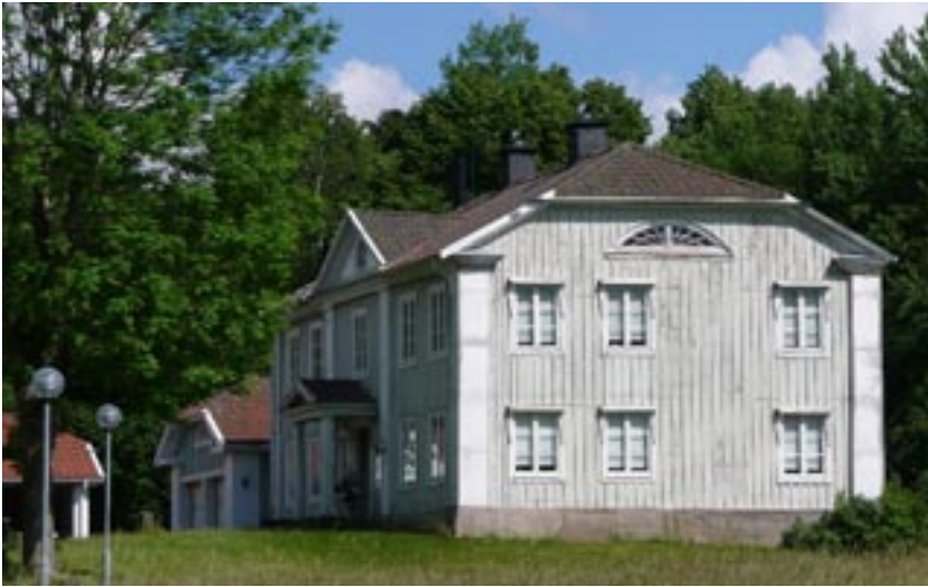
The office building of Sävsjöströms bruk, Lenhovda parish, Kronobergs län.

Select nobles, high military officials and wealthy merchants were given the right to erect ironworks (järnbruks/bruks) and produce a fixed amount of bar iron; these ironworks owners were called 'brukspatron'. Almost 90% of the bar iron they produced was exported abroad, primarily to England and later America. Bergsmän were legally allowed to continue to make only pig iron, not bar iron; in reality, they continued to make both. These systems, the local and the 'proto-industrial ironworks' model, I'll call it, existed in parallel. However, through the 17th and early 18th centuries, many bergsmän became indebted to ironworks when unable to repay loans. They were forced to sell their iron-making rights to the ironworks, and their role in the system diminished.